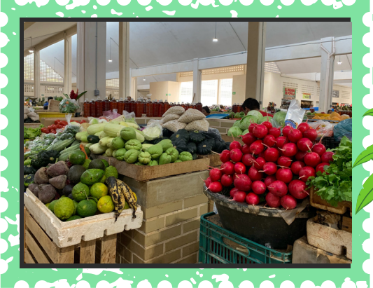
Fruit stalls at the market in the colonial city of Valladolid

Every year the Van Dykens travel to their other house, located in the Yucatán Peninsula, near the small pueblo of Chemuyil, which is Mayan for "heart of the tree".