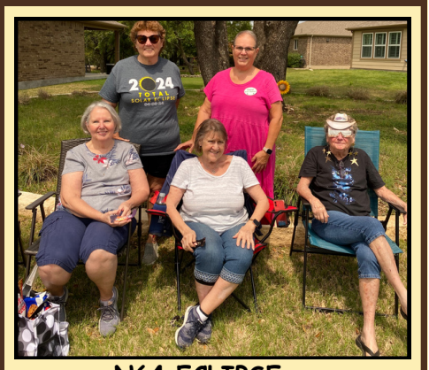
N64 ECLIPSE VIWING PARTY