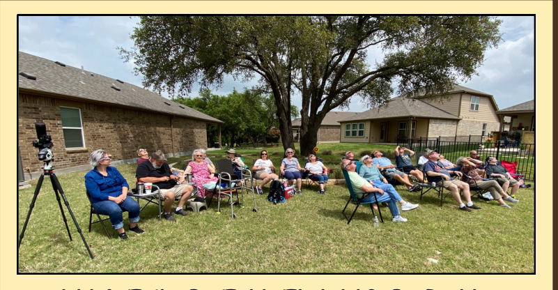
N64 ECLIPSE VIEWING PARTY April 8, 2024