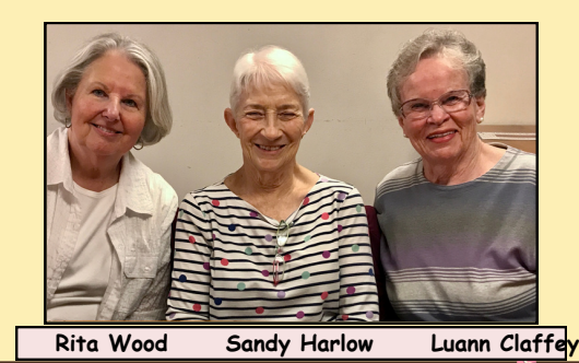
VIEW MORE PHOTOS ON THE N64 MICROSITE