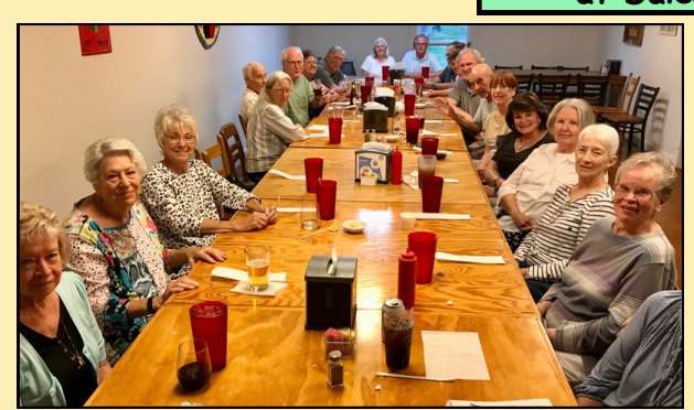
N64 Diners - Party of 20