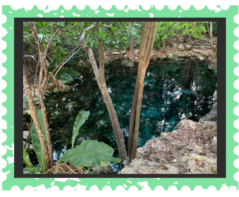
One of the cenotes* in Carol and Ted's neighborhood

*Cenotes are underground cave systems that occur when the limestone plateau that covers large parts of Mexico's Yucatán Peninsula is undercut by water.