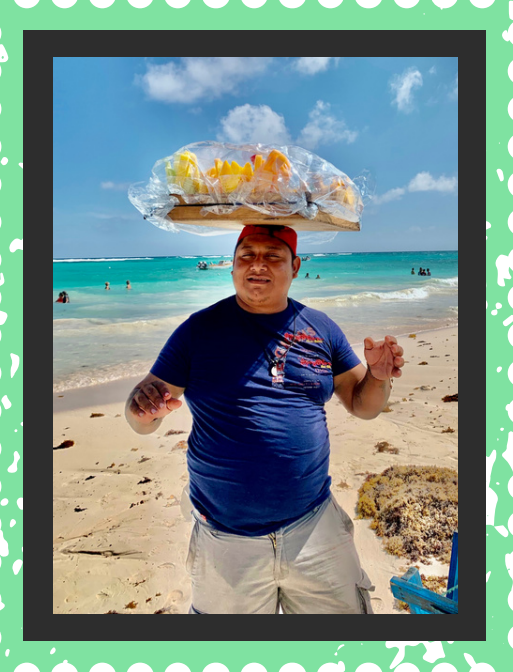
Man selling fruit at XpuHa Beach