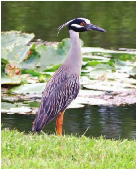
YELLOW CROWNED NIGHT HERON BY BARBARA LUNA