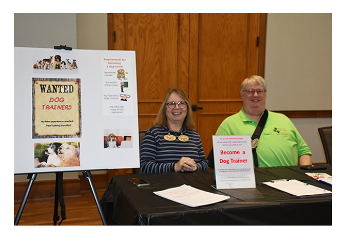
Dog Trainers Wanted