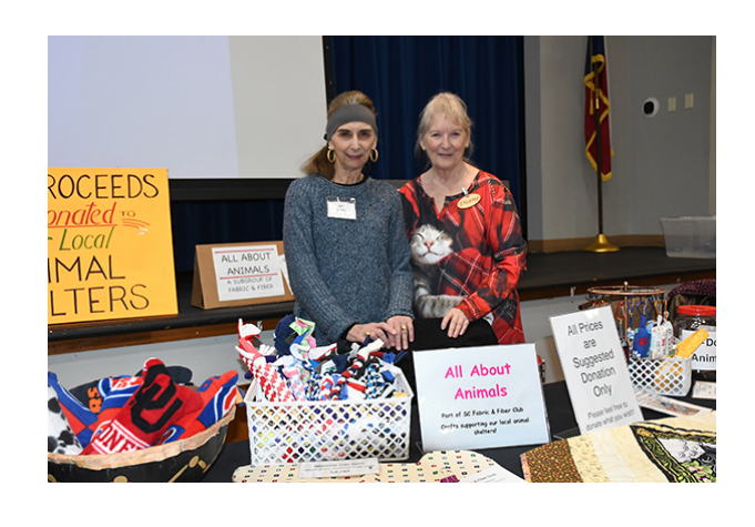
Sun City All About Animals