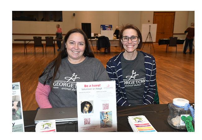
Georgetown Animal Shelter