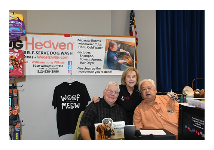
Wag Heaven Pet Supplies