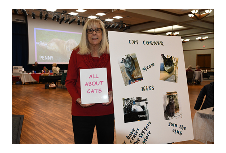
All About Cats