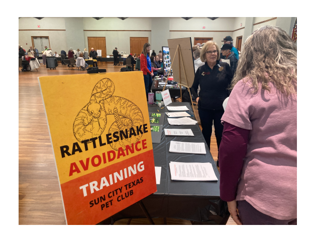
Snake Avoidance Program