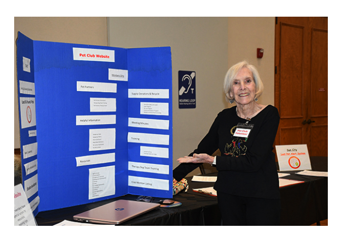
Pet Club Website