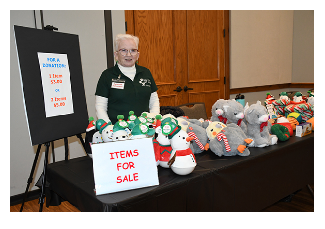
New Toys for Sale