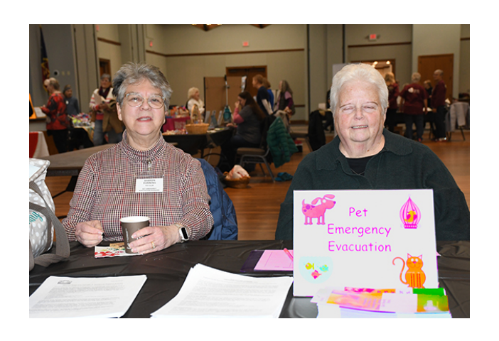
Pet Emergency Evacuation Program