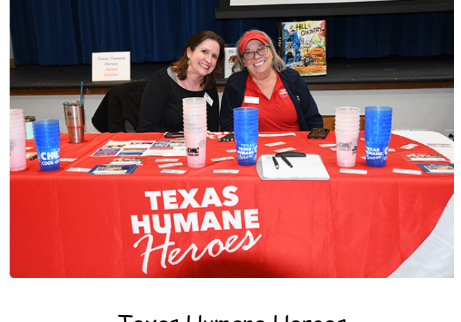
Texas Humane Heroes