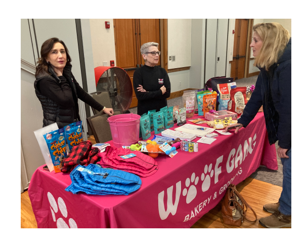
Woof Gang Bakery and Grooming