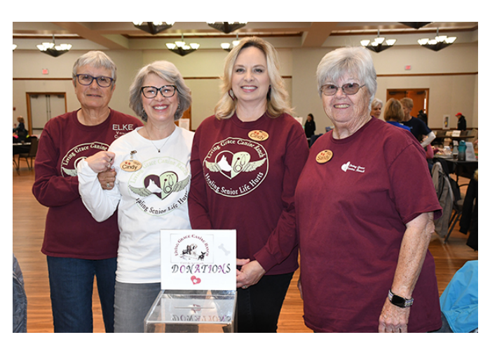
Living Grace Canine Ranch