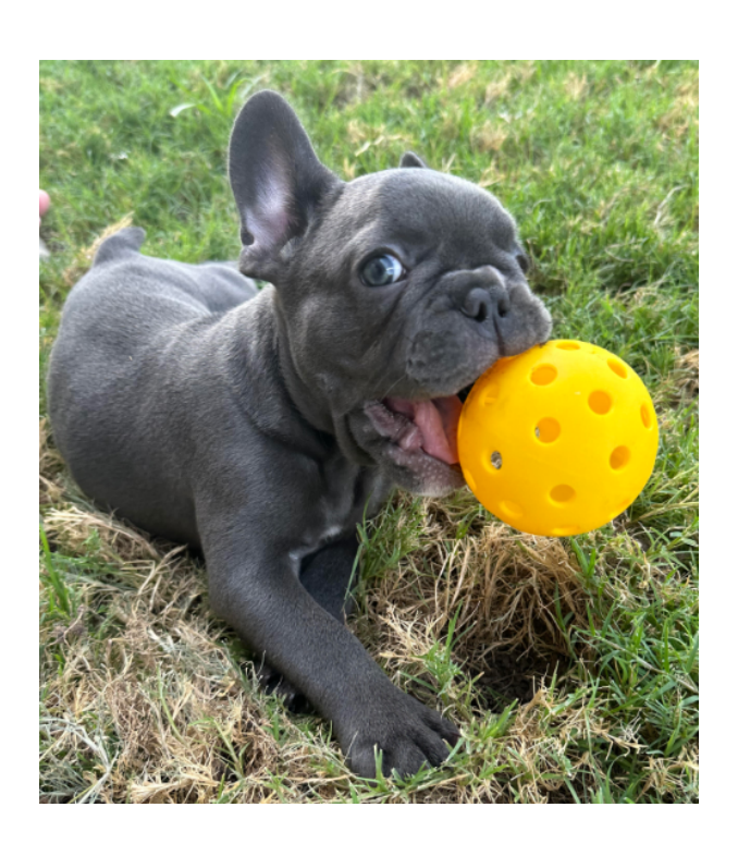
RAFA getting ready to return a ball