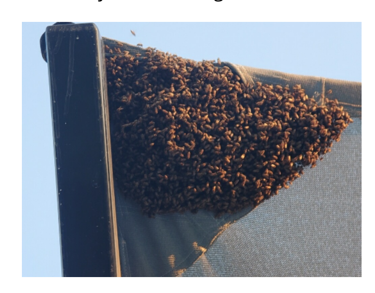
New Players swarming to the courts