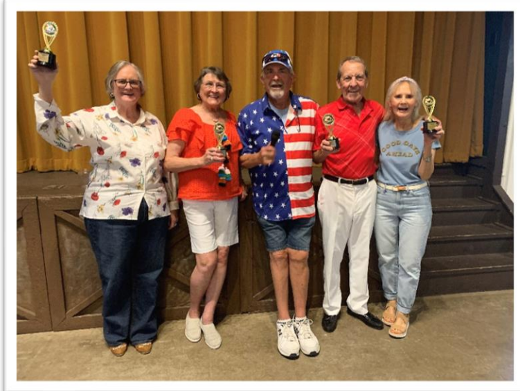
A good time was had by all on May 26 at Reunion Ranch, especially the winners of the corn hole contest!