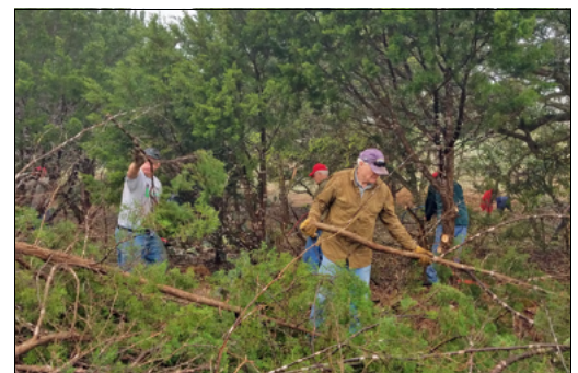
The Firewise Volunteer Clearing Crew removing small Ashe junipers (cedars).