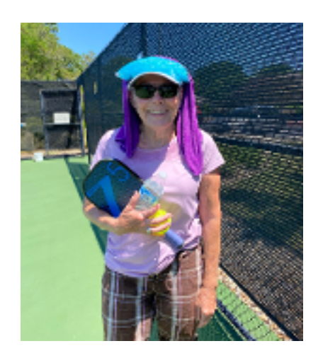
The latest in cooling head gear!