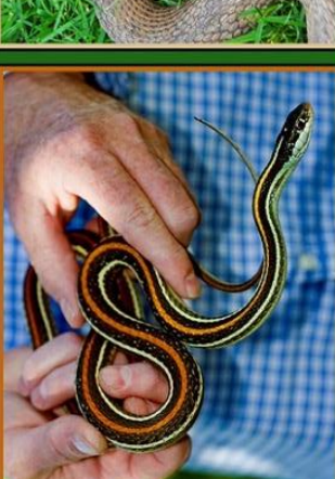
Blotched Water Snake