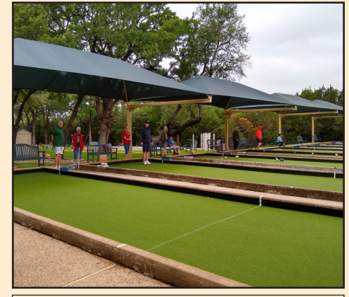
Visit the historic Bocceland courts and learn the plans they have to improve them.