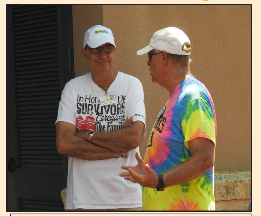
Learn more about these colorful people and what they do for fun.