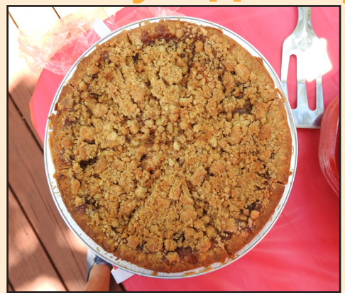
What is this Bocceland national treat? Learn how the Boccelanders eat it.