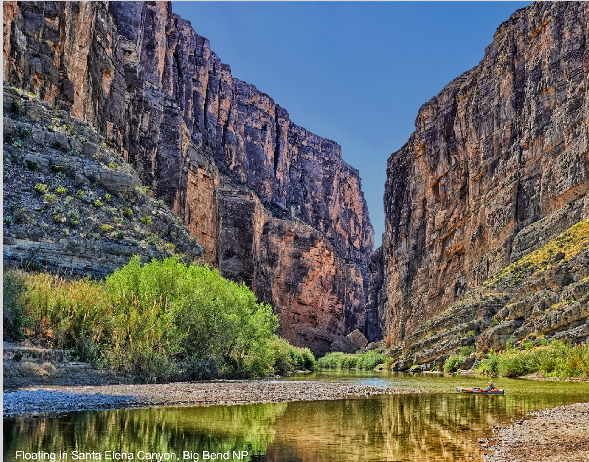
Floating in Santa Elena Canyon, Big Bend NP

Sun City Photography Club Newsletter May 2019