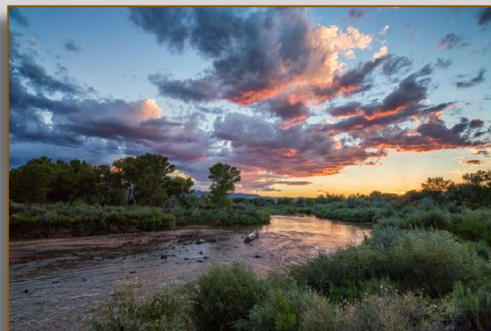
Allen Utzig, Abiquiu Sunset