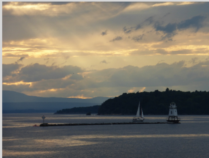
Jim Sandham, Clearing Storm

Club Members are encouraged to attend the SIG's monthly meetings on 4th Friday from 10 am to noon in the Studio (Game rooms 1 & 2 in the Activities Center). Go ahead - take a chance - you will be welcomed and accepted at any level - join us in developing our photographic eye and skills.