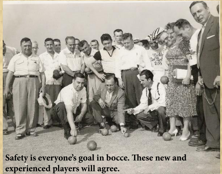
Safety is everyone's goal in bocce. These new and experienced players will agree.

The club does have “chicken feet” and ball cradles on risers. Both these items can be used to reduce bending for ball retrieval. The chicken feet are in the shed and the risers are in the plastic storage unit outside the shed. The risers are heavy and should be moved only by capable members. The risers are to be placed on the side of the courts next to the existing ball cradles.