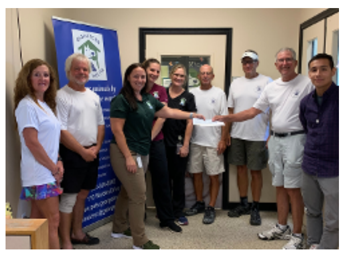
Donations presented to Caring Place (L) and Georgetown Animal Shelter (R) by Big Bopper Tournament Committee members.