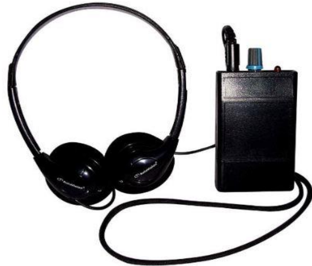
Induction Loop Receiver with Headphones

If you don't have T-coil hearing aids, try this receiver to experience the T-coil difference. Be sure to return them before you leave today. I will be publishing a current price list from Loop America should you want your own.