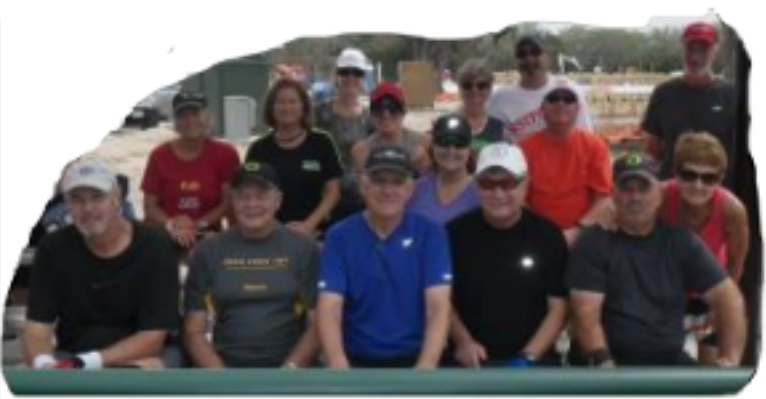
The "Oldies But Goodies" pose with their game faces before the competition.

To participate in the intermediate training program, interested candidates should meet the following pre-requisites and contact Peg O'Toole, Player Development Director.