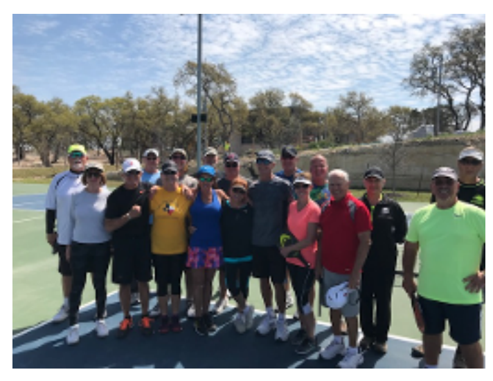
Sun City A & B Teams