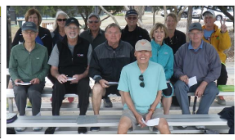
The "Newbies" smile during program orientation prior to the start of class. Note: Sue Long and Terri Klein not pictured due to work/play conflict.