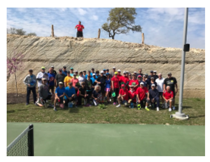
All ICPM Participants

The March 14 Meet had forty eight players from four different Communities: Sweetgrass (West Houston), Hill Country Retreat (San Antonio), Kissing Tree (San Marcos) and, of course, the mother ship, Sun City Texas.