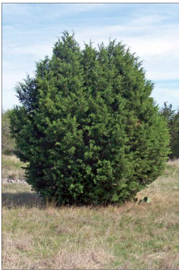
Figure 1. The Ashe juniper is a common tree growing in the Texas Hill Country.

Ashe juniper ( Juniperus ashei ) is a native invasive tree found in the Texas Hill Country and into Missouri (Figure 1). It is also know as cedar, mountain cedar, post cedar, and other common names.