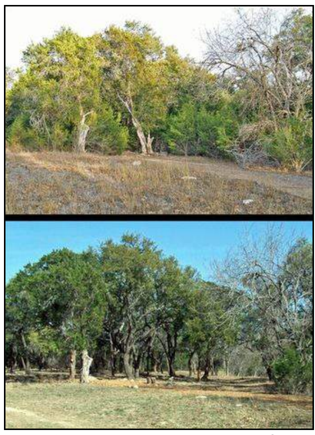
Figure 3. An area on Tranquility Trail before clearing (top). After clearing, the open area below the trees allows more flood water to flow through.

Third, the Ashe juniper is flammable due to its oil content (Figure 3). Embers do not easily ignite the tree. A grass fire usually provides the sustained heat source and flames required to ignite, often from the inside. Within the tree, there is dead material, mostly old needles at the