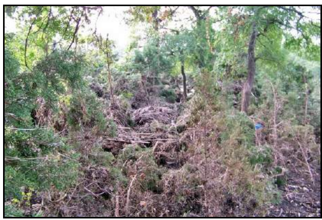
Figure 2. An example of the trash accumulation by Ashe juniper in Berry Creek.

Second, if Ashe juniper is allowed to grow in the Berry and Cowan Creek flood plain and other drainages, it accumulates flood debris creating dams (Figure 2). Major flood events occurred in 2007 and 2010. In 2007, a 100 year event reached the yards of several houses. In 2010, a 500 year event flood waters entered 32 houses on September 7-8. Large debris dams were found throughout Berry and Cowan Creeks. The dams slowed the water allowing it to reach higher levels.