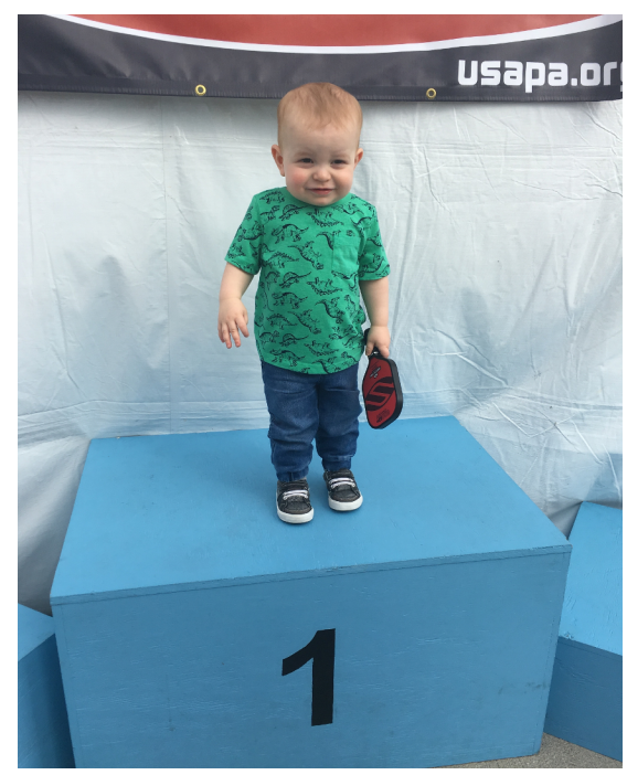
Future (2077) Sun City Pball Club member?

The husband, typically non-romantic, replied: "I am on the toilet. Please advise."