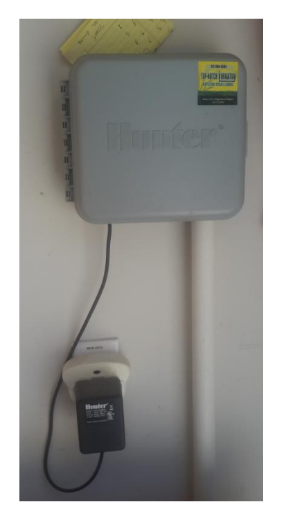
Hunter Pro-C Model 300