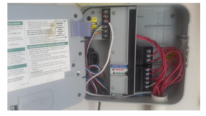
N.B. I trimmed the power cable only to see that it was too short, then decided to skip trimming other cables.