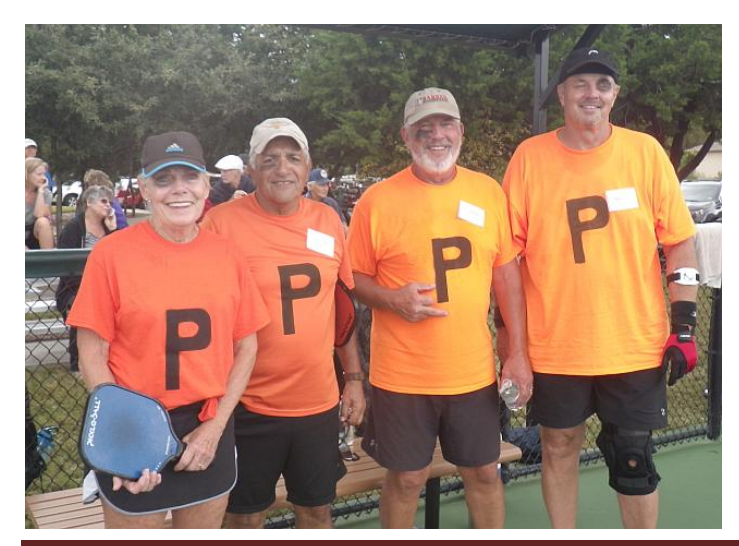
November 1, 2015