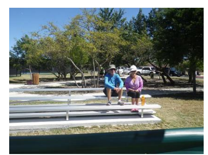
Spectators pack the stands during Division B Team Doubles