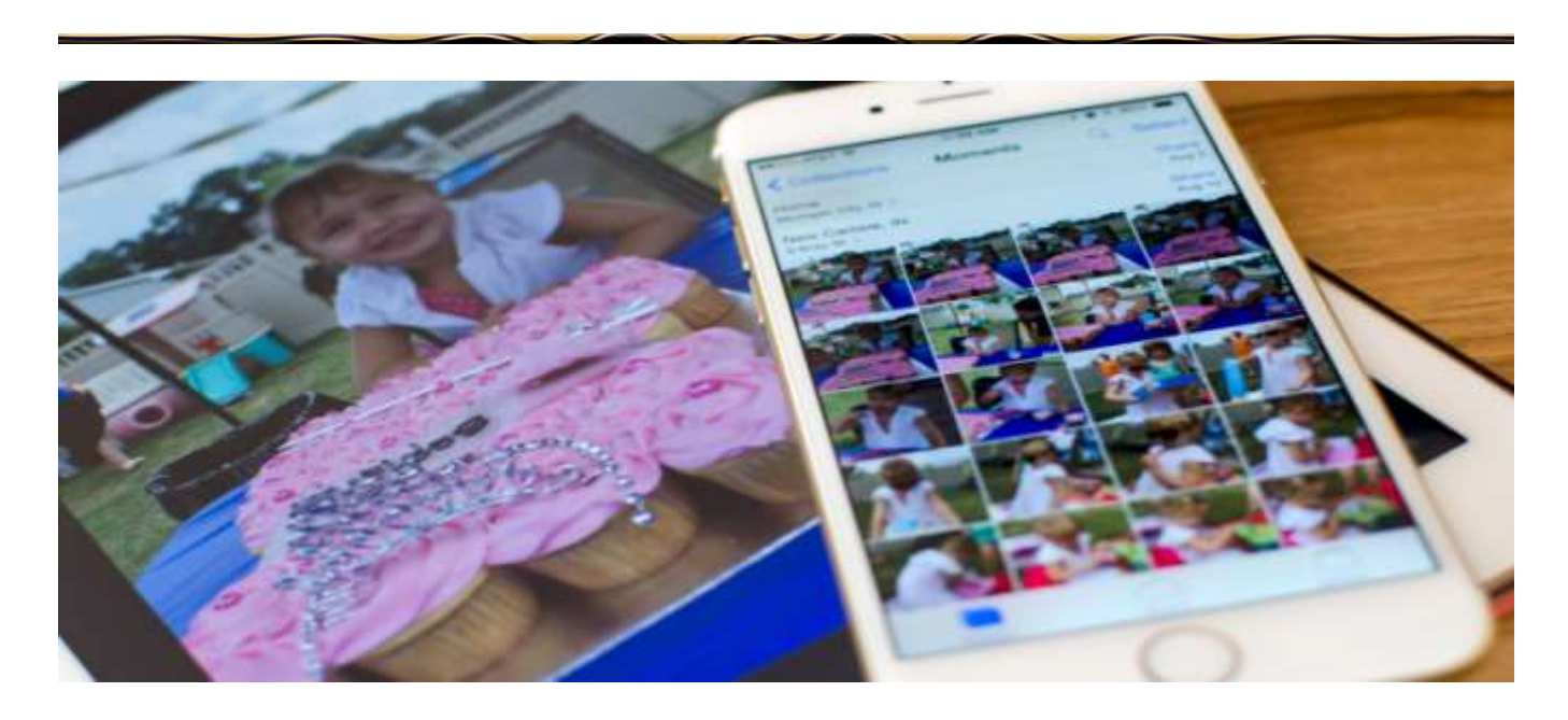
How to use Photos for iPhone and iPad: The ultimate guide

Rounding out the features of this version 3.2 release are a new undo button in edit mode and "dramatically decreased" editing times, which are both nice little updates. You can grab the latest version of VSCO Cam from the App Store