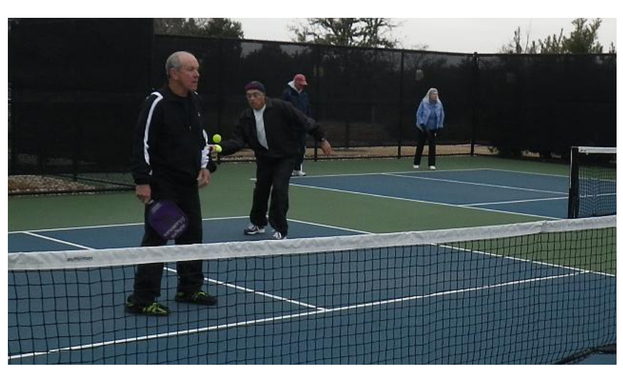
Division B, Group A Individual Doubles pound it out.