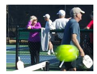
Rally Scoring may reduce player wait time.

This system is currently used in badminton and volleyball. It has also been employed on a limited basis in pickleball tournaments with a large number of registrants, but a small number of courts. It shows potential to reduce the amount of time required to play a game by 30-40%. This provides a faster throughput of players on the court, and consequently, reduces wait time for other players.