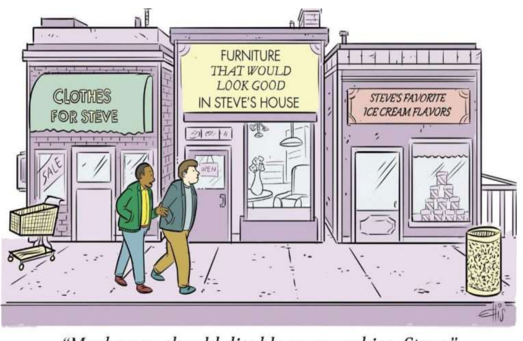
"Maybe you should disable your cookies, Steve."