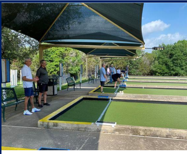
What a beautiful day and facility!!