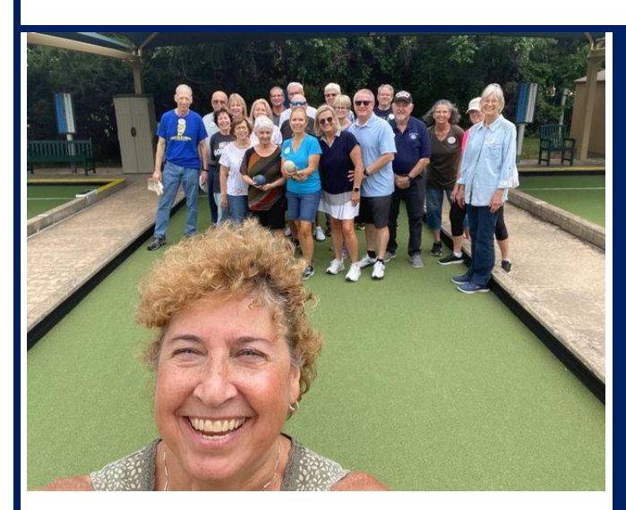
The Whole Gang!!