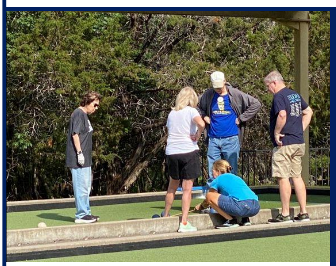
Precisely measuring for the score!