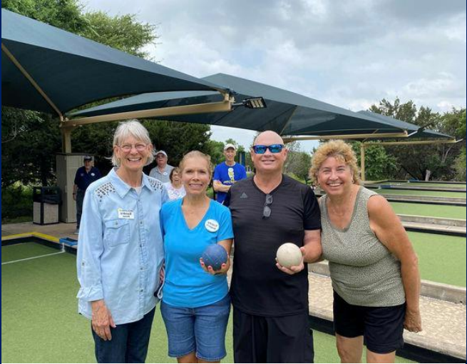
The bell ringers! 🗘 We each scored 4 points in one turn