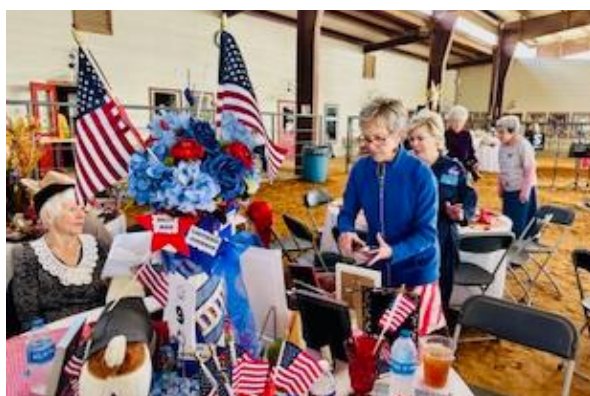
WHO table that won the competition in 2023

This event, hosted for the local women's business community, will feature brunch, specialty beverages, raffles, a keynote speech, and a special table decorating competition.