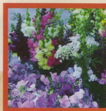
Wendy's Orb Action, available in the Subscriber Download area, turns a cropped image (above) into a lovely orb (left).