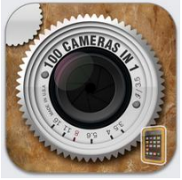
100 Cameras in 1