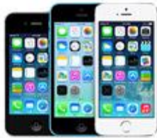
Compare iPhone Models