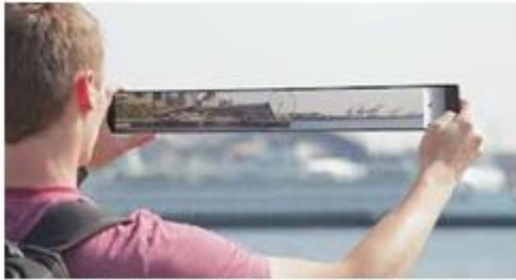
Panoramic iPhone 15?