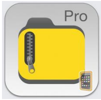
iZip Pro - Zip Unzip Unrar Tool