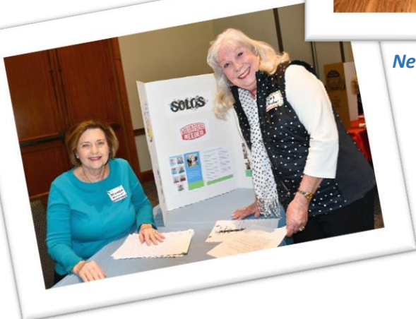
New members in the past year