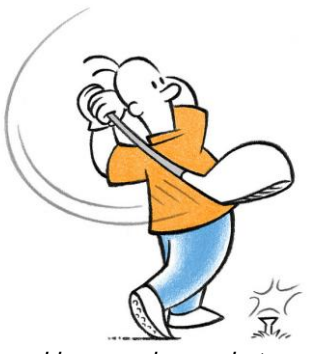
I love you honey, but...

"No time at all," says her husband. "Everybody's already agreed to let him play through."