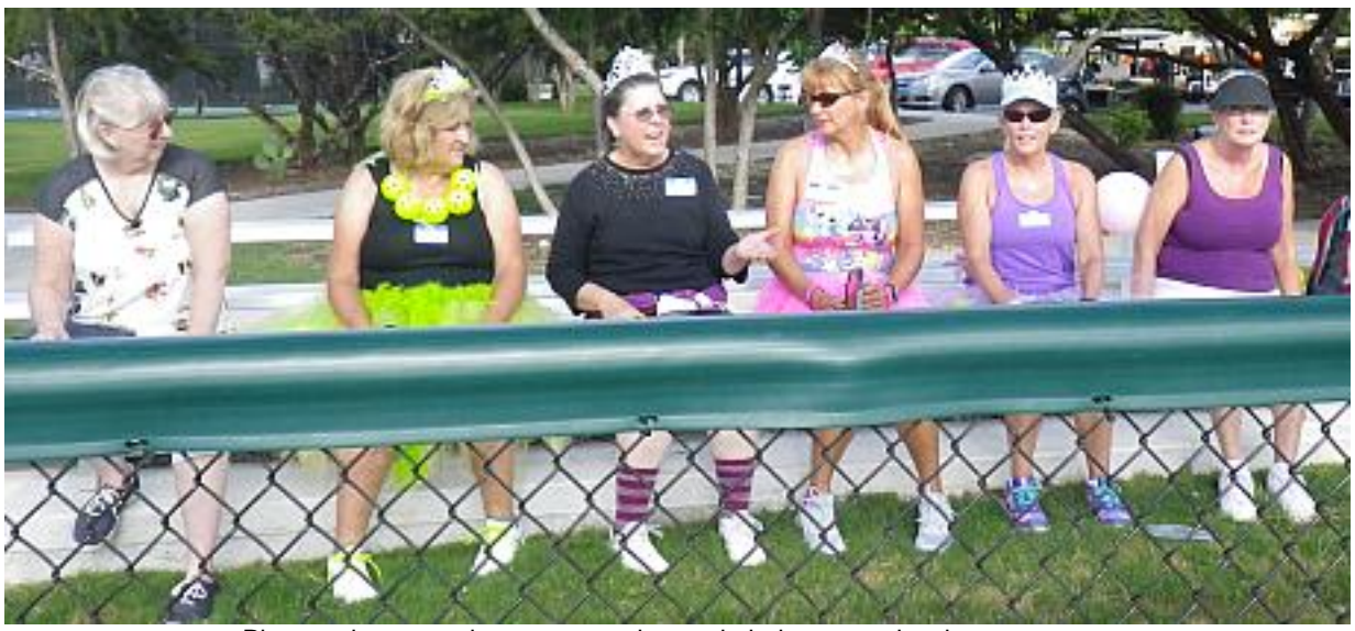
Players cheer on other teams as they wait their turn to play the next game.