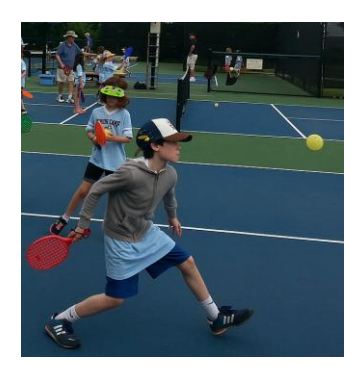
Future pros show their stuff.