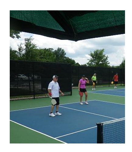
A few pictures from the 2015 Summer League, Ladder 2, Low Division.