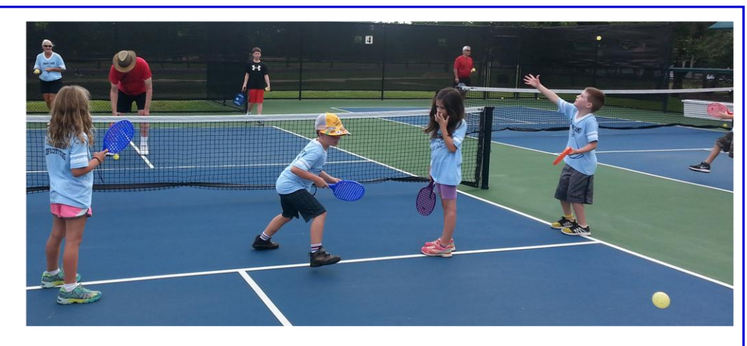
In a single photo, we see patience, resignation, determination, boredom and a call to the heavens for help.