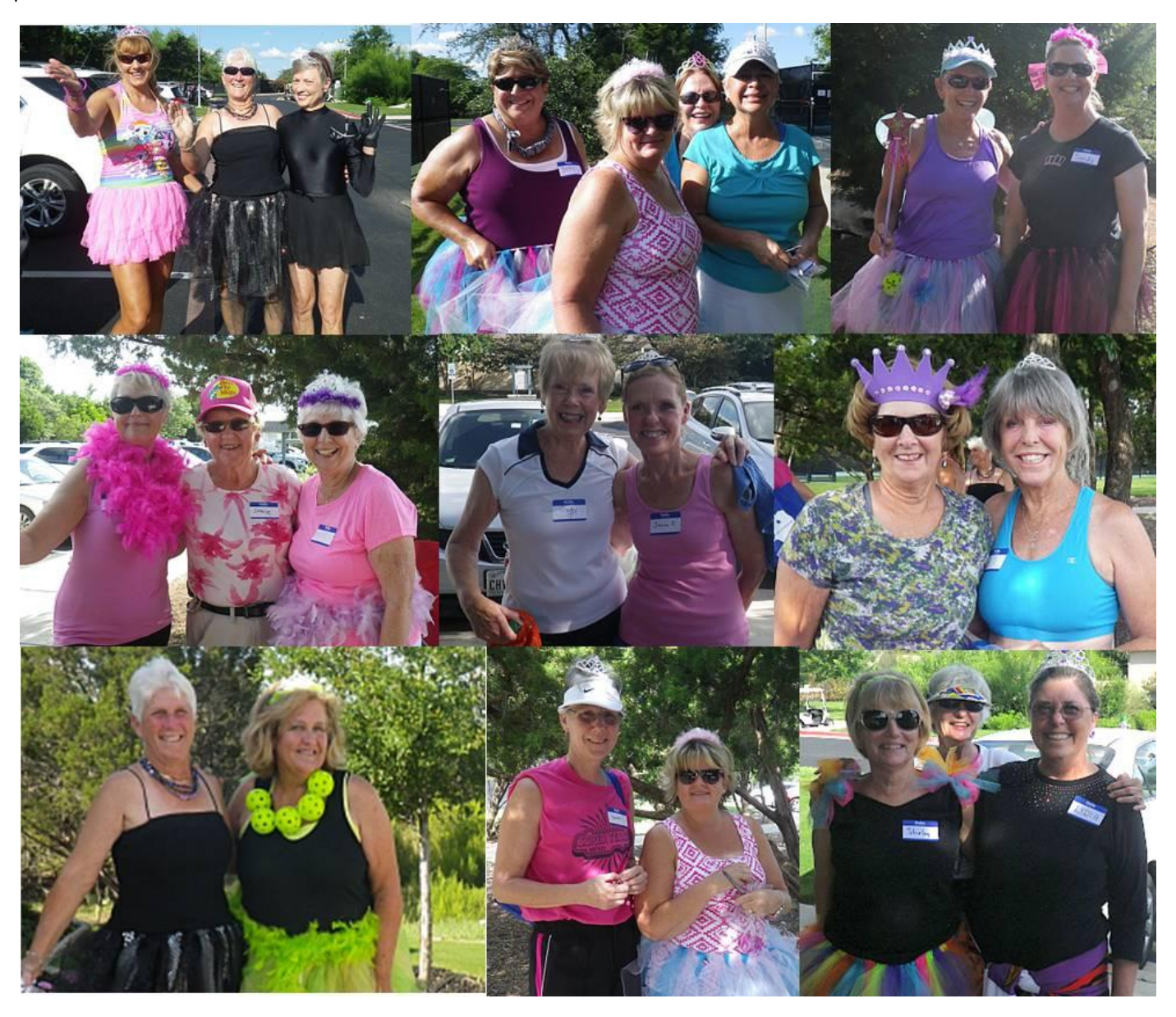
With feathers and sparkles in place, the players take time to pose for a photo.

On Wednesday night, June 24, 2015, twenty six women from the Sun City Pickleball Club converged on Courts 1 – 4 and proved that you can indeed be athletic AND pretty at the same time. These fashion divas donned their favorite tutus and tiaras and posed for pictures before tying on their court shoes and showing their grit on the pickleball court. While it may not have been the place where all their dreams of becoming a princess came true, it was an event filled with fun, laughs, and of course, a whole lot of pickleball.