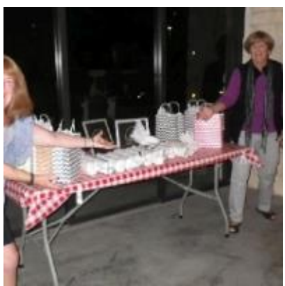
And then there's the raffle.