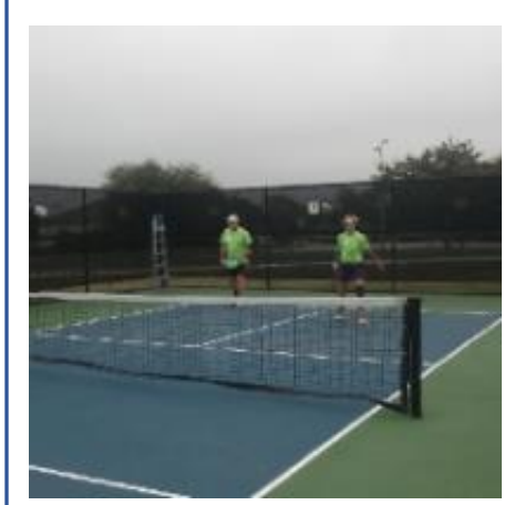
Guarding no man's land.

Stacy Group generously donated and served lunch to tournament players courtside, as the tournament director made a command decision to beat the weather and play throughout the lunch hour. Following the day's competition, participants went home to wash up and put on clean duds.