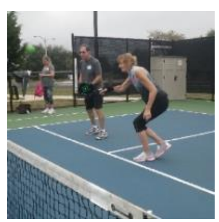
It's mine. I got it.