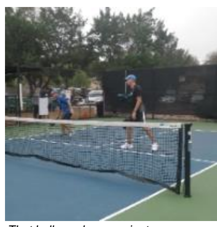
That ball was here a minute ago.