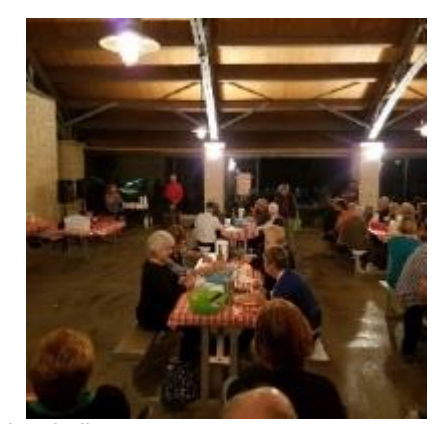
150 satisfied pickleball customers chow down at the shrimp boil.