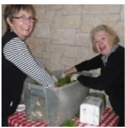
Gotta have those greens.