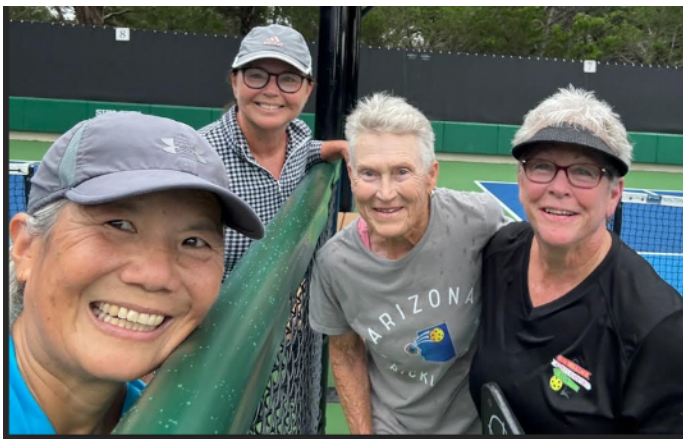
First players on the resurfaced Retreat Courts