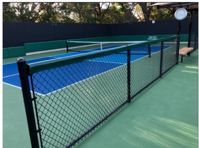
New Dividers at the Retreat