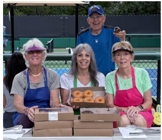
Donuts at the Retreat