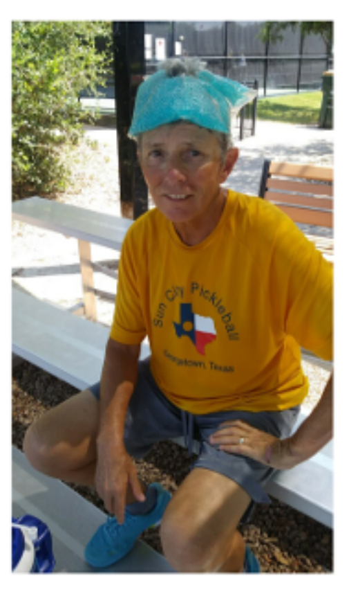
Temperatures of over 100° have led to some interesting choices of headgear!

This morning I accidentally changed the voice on my GPS to "Male." Now it just says, "It's around here somewhere. Keep driving."