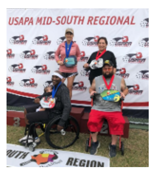
Congratulations to all of these winners:

Below are some great photos from the Wheelchair-Hybrid Division