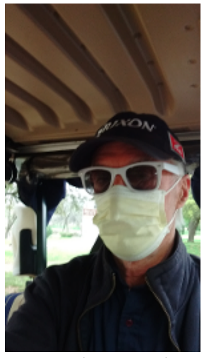
Guess who went to the courts but couldn't find any players?