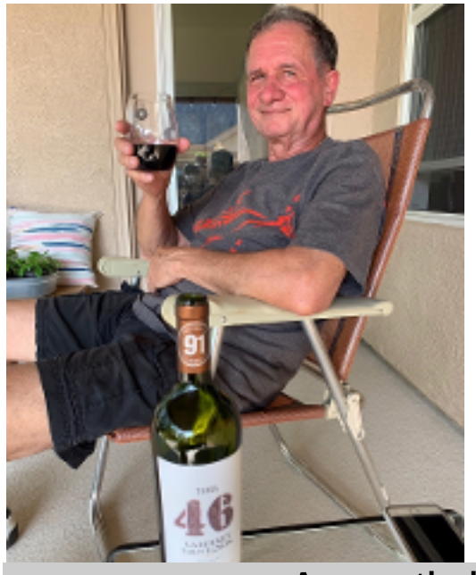
Apparently drinking helps.