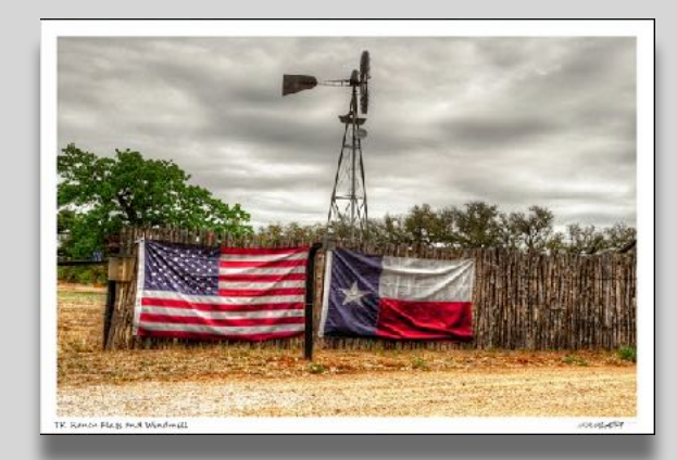
TK Ranch Flags & Windmill

St. David's Healing Arts Gallery inside of St. David's Hospital in Georgetown has a new exhibit! The exhibit opens to the public on Saturday, August 26th and runs through October 20. Twenty club members have contributed 30 images to the "Georgetown and the Hill Country: the places, people, flora and fauna that make this a unique part of Central Texas".