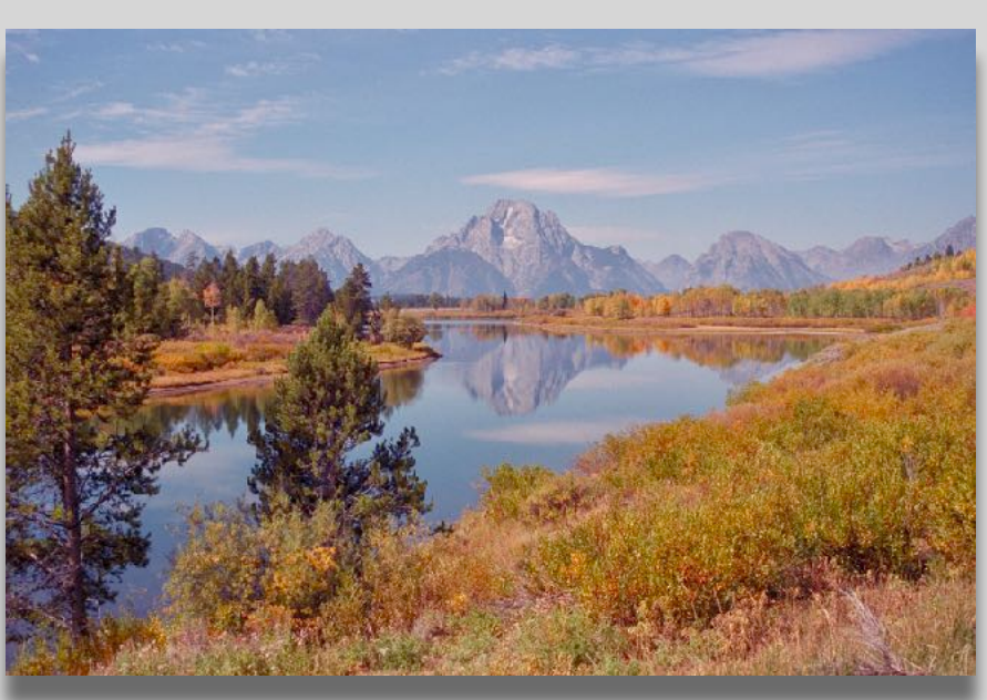
Fall at Oxbow Bend