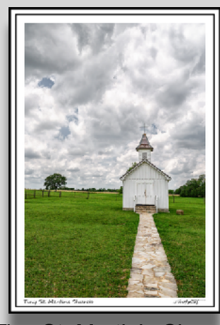
Tiny St. Martin's Church