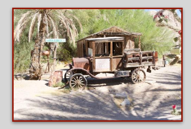
Baby Giraffe Bridge Old Truck in the Desert