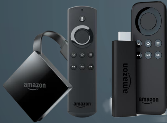
Amazon Fire TV