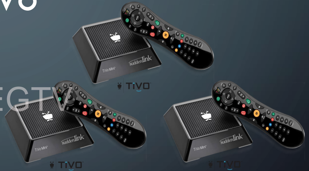
TiVo Mini Receiver for other rooms with tv's.