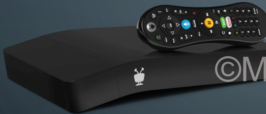
Main TiVo Receiver