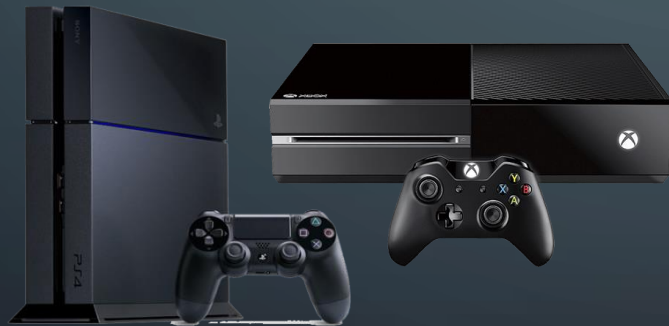
Video Game System (XBOX/PS4)