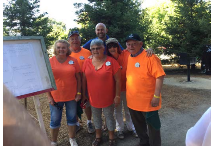
The Sun City Bocce Team in Yountville, CA