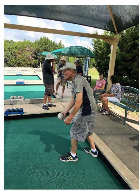
Stanley throwing the first new ball