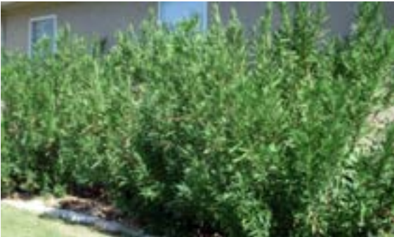
Figure 2. Is the gas meter here?

Occasionally, Atmos Energy includes a folded document with the bill. It has detailed information about natural gas, safety, and more. Please read it!