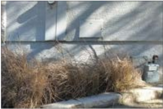
Figure 3. Flammable plants should not be close to the gas meter.