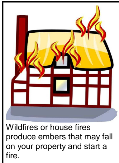
Wildfires or house fires produce embers that may fall on your property and start a fire.

Sun City Texas has been a Recognized Firewise Community since 2009. Firewise is a voluntary program administered in Texas through the Texas A&M Forest Service. The Firewise approach encourages homeowners to help protect people, their property, and nearby natural resources from falling embers generated by nearby wildfires or house fires.