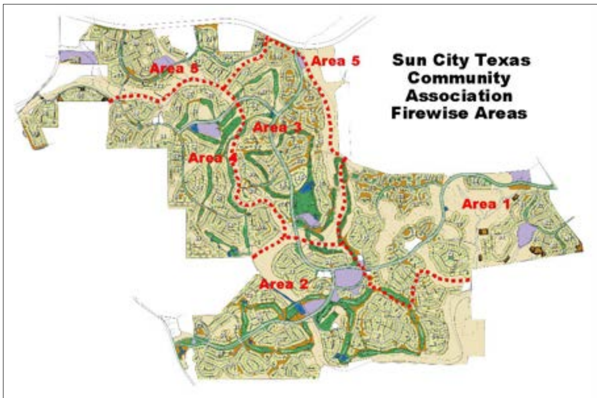
Figure 1. The 2024 boundary of Sun City Texas and the five Firewise areas.

The Sun City Texas Community Association (CA) is responsible for the management of all non-residential property. CA documents define a set of five maintenance levels for management. Included in these levels are federally defined protected areas for karst formations (underground caves) for endangered species. The CA also owns and maintains three golf courses.