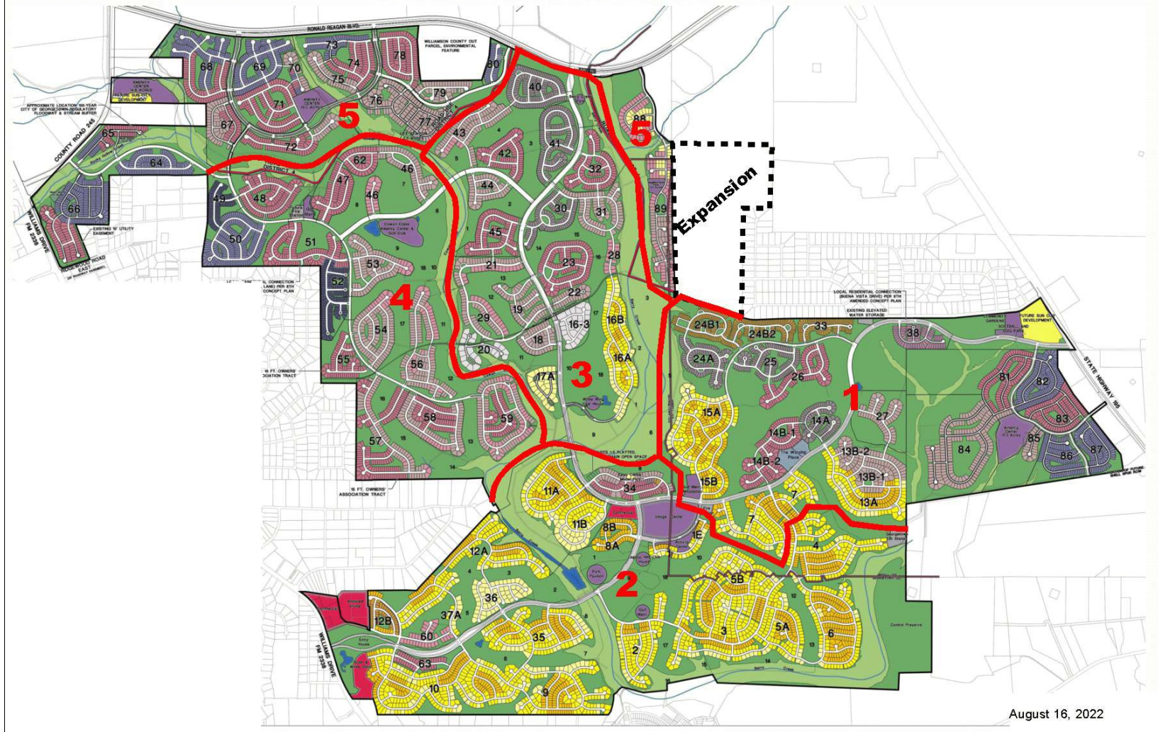
Figure 1. The boundaries of the five Firewise areas.