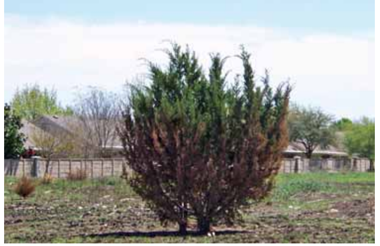
This is the same juniper shown in the last issue. Note the green plants growing.

The photos below show what has happened in the 30 days following the fire. Vegetation is greening and the juniper trees haven't changed much!