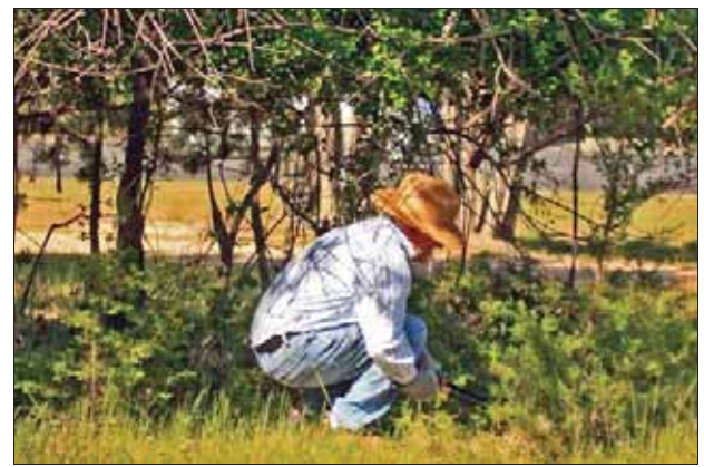
And another juniper bites the dust!!!!!!!