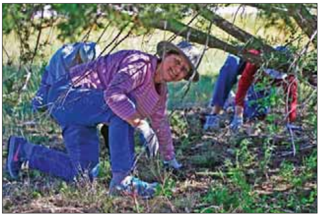
Volunteers work under trees to remove junipers.