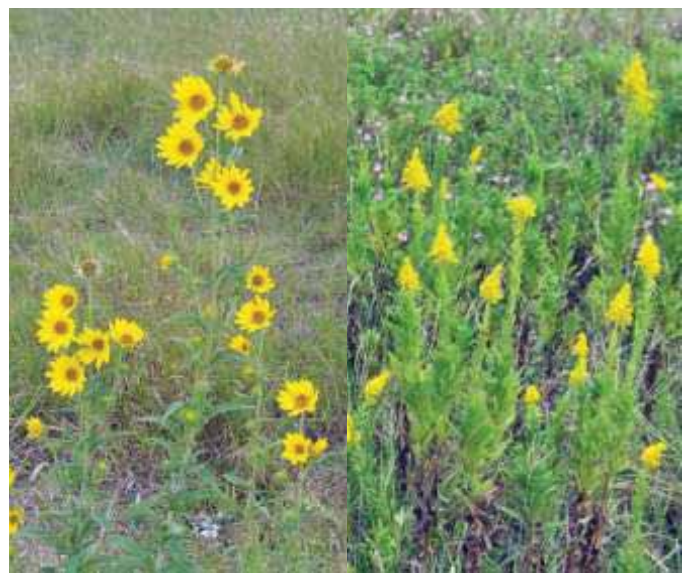
Maximillian sunflower (left) and golden rod are two wildflowers beginning to bloom. Maximillian sunflower is in the burned area and goldenrod is in the unburned area.

The vegetation in the February 20 wildfire continues to improve. The larger cedar tree continues to loose needles on the lower part that was desiccated by the fire. The small cedar to the left remains brown and is dead. Little bluestem, sideoates gramma, silver bluestem, Maximillian sunflower and others are showing their fall colors.