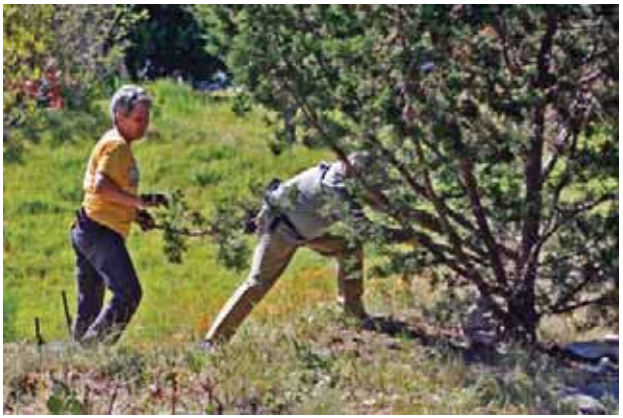
Volunteers limp up a juniper to reduce the fire hazard.