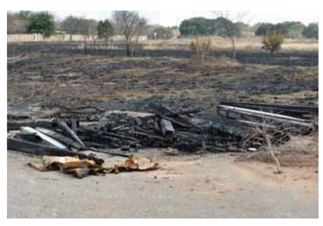
The probable source of the wildfire. The scrap lumber has been here since before 2008 based on Google Earth imagery.