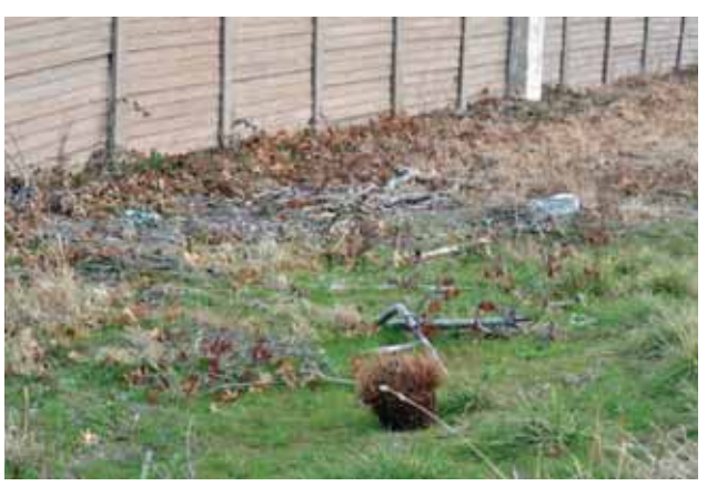
Apparently some of the Sun City residents have been throwing their yard waste over the fence. This creates a fire hazard right at their own backyard!

Please Promote the Home Ignition Zone Assessment in your neighborhood! You may use the information in this newsletter.