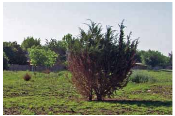
Again, the same juniper shown in the last issue. Plants are green and growing well.

The photos below show what has happened in the 3 months following the fire. Vegetation is greening and the juniper trees remain unchanged!