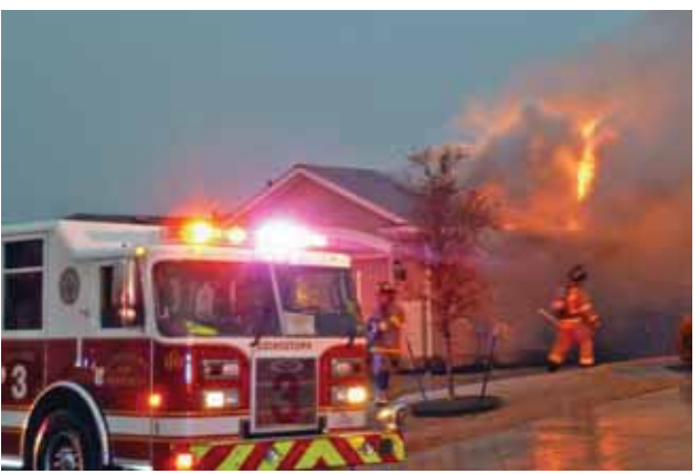
This house on Salado Creek Lane was struck by lightning. The Georgetown Fire Department was able to contain the fire.

Please be careful with the lawns still dormant and the weather dry!