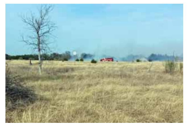
A view of the wildfire area from the Williams Drive side with GFD crew at work.

On Thursday afternoon, February 20, a wildfire occurred behind Walgreens. Thanks to the quick response of the Georgetown Fire Department (GFD), the fire was under control quickly. As a result of their quick action and a fuel break next to the fence behind Neighborhood 12, no homes were damaged. These photos show the results.