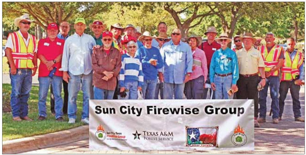
The Blue Group that cleared the Preserve Area on Hills of Texas.