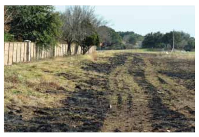
The fuel break stopped the fire and GFD made sure it was out.