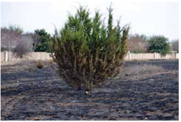
The Ashe juniper (cedar) did not burn as many expect but at least the lower part will turn brown shortly from the heat.