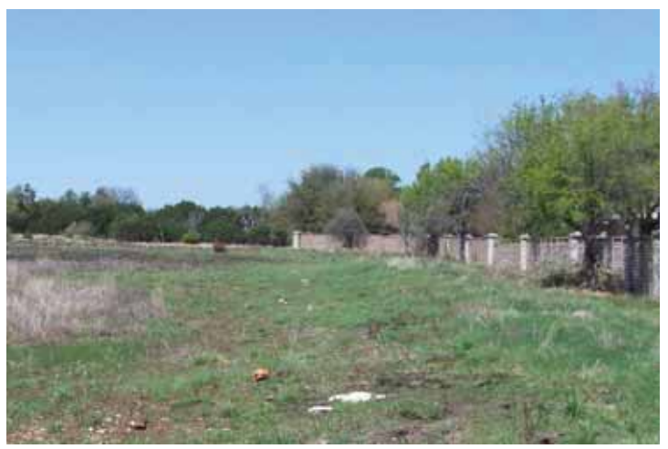
This view along the concrete fence has good growth after the fire.