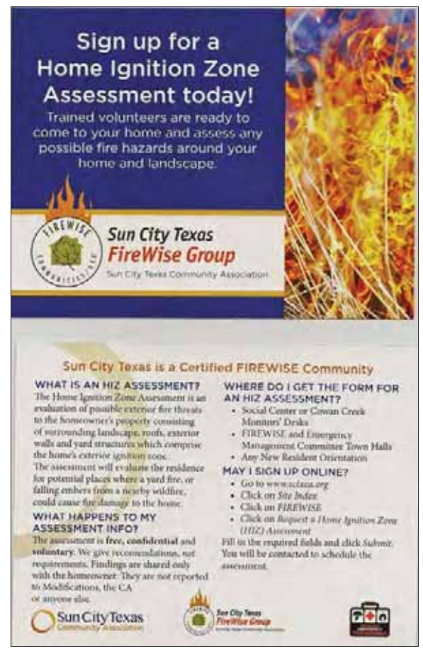
The postcard developed to promote the Home Ignition Zone Assesment.