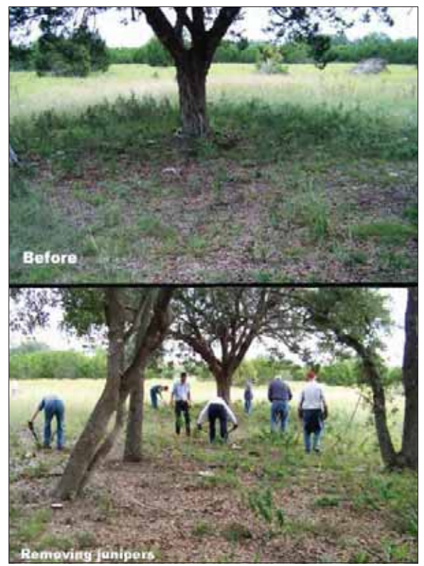
Ashe juniper is an invasive native tree. The Firewise Volunteer Clearing Crew removes them using hand tools.