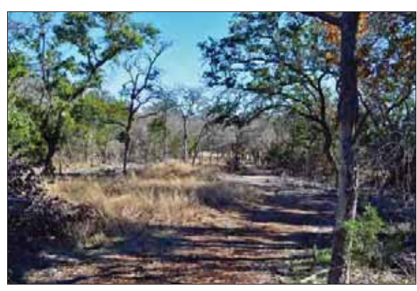
Dan Dodson explained how Mockingbird Trail uses fuel breaks while reducing the risk of wildifres.