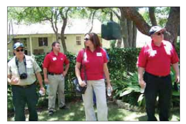
Representatives of the USAA Insurance Company visited to learn from Sun City Texas' experience with Firewise.